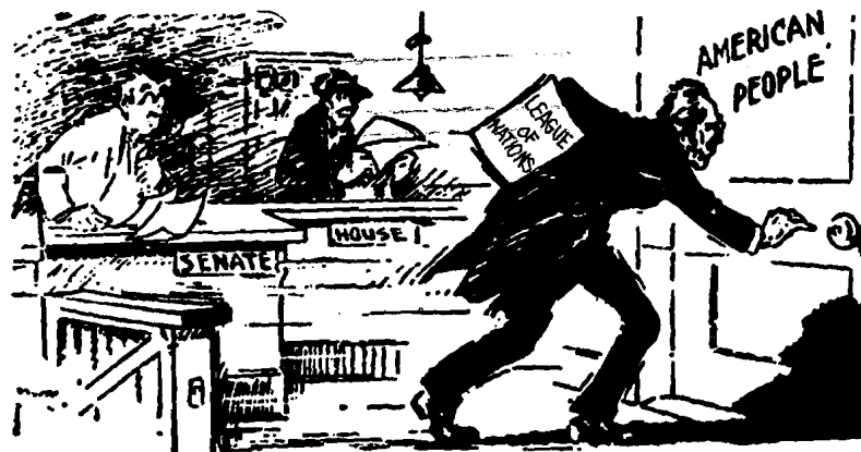
"GOING TO TALK TO THE BOSS"