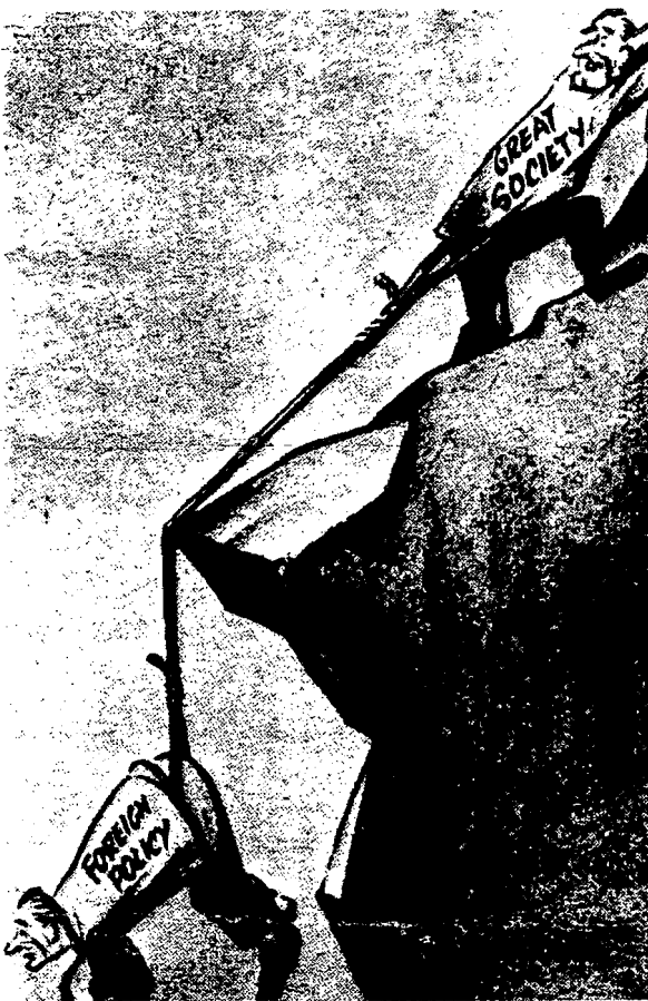
Bill Crawford © dist. by Newspaper Enterprise Association.